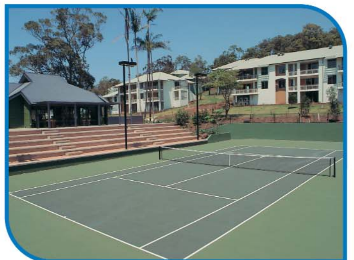
Concrete or Asphalt