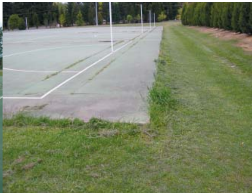
Photo 3 - Trip hazards on Netball court