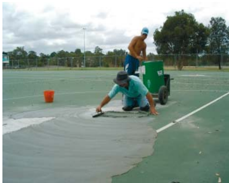
Photo 2 - Repairing depressions in court surface