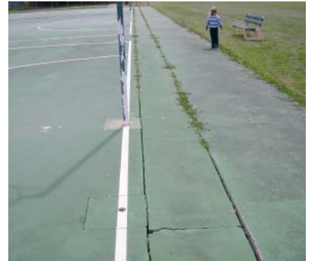
Photo 1 - Example of trip hazards on Netball Courts